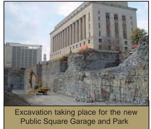
Excavation taking place for the new Public Square Garage and Park

The move was necessary so that a major renovation of the Historic Courthouse could take place and so that the Birch Building could be built adjacent to the Ben West Building, which itself underwent significant renovations. But making the move happen in a seamless way was a logistical challenge which those involved remember to this day. It was 10 years ago this month in April 2003 when the moving trucks began to roll. Business as usual ceased at 4:30 p.m. on Friday, April 4th. Over the next two weeks, the employees of this office, as well as the judge's offices and other courthouse operations, worked tirelessly to relocate every aspect of the court system to Metro Center as quickly as possible. Tens of thousands of files had to be boxed up and then unpacked on the receiving end. Hundreds of pieces of furniture, machinery, computer equipment and countless boxes of personal items had to be loaded up and then delivered to the correct location which was often a challenge in and of itself. Making matters