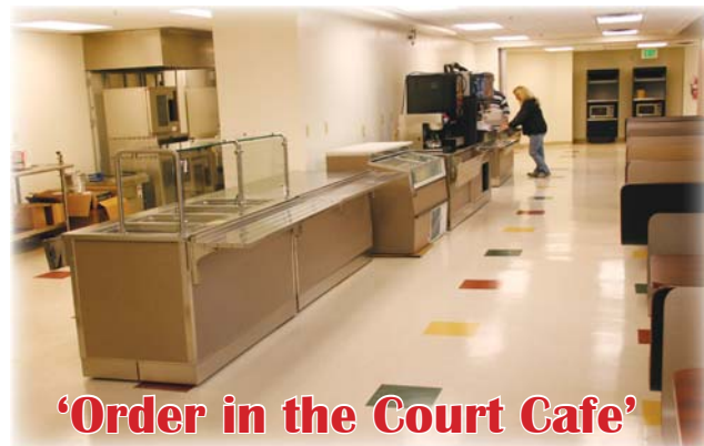
‘Order in the Court Cafe’

A boon for the general public is a food facility called “Order in the Court Cafe” featuring vending machines for snacks and drinks, plus booths to accommodate some 50 diners when hot meals are offered in early November. Previously, no refreshments were available to the general public.