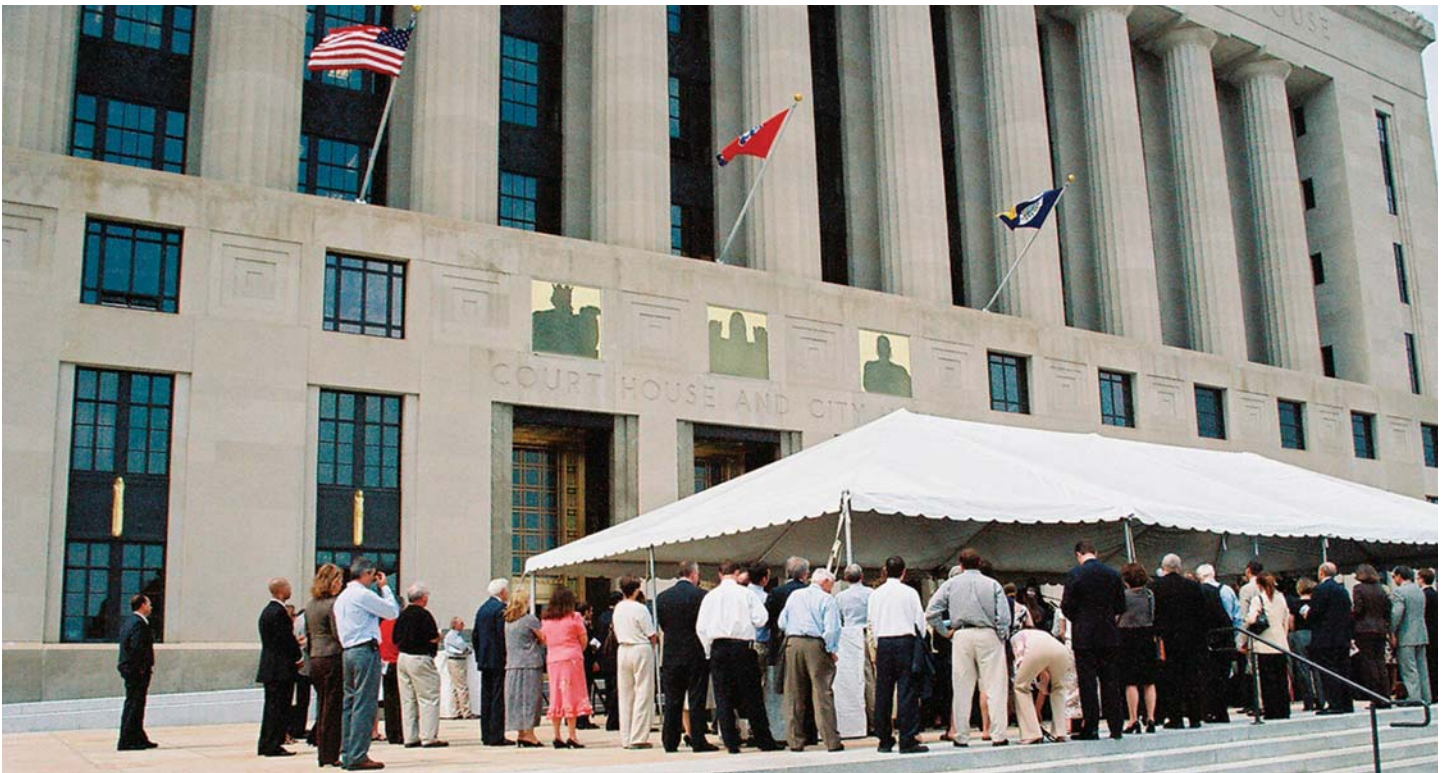
CROWDS GATHER TO WITNESS THE OFFICIAL REDEDICATION OF DAVIDSON COUNTY'S HISTORIC COURTHOUSE ON MAY 3