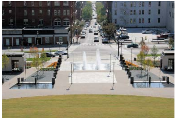
of Second Avenue from courthouse entrance. A portion of the renovated courthouse is currently being occupied and work continues on upper floors that will house state civil courts and affiliated offices sometime next Spring.