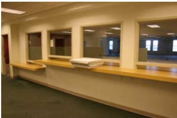
CASHIER WINDOWS IN TRAFFIC VIOLATIONS BUREAU