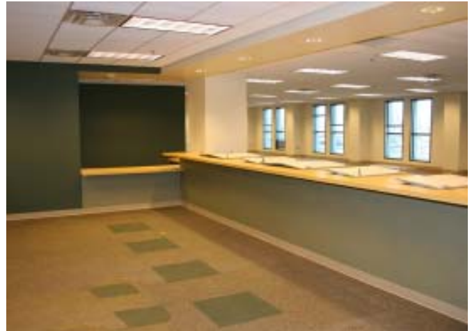
CUSTOMER SERVICE COUNTER IN GENERAL SESSIONS CIVIL DIVISION