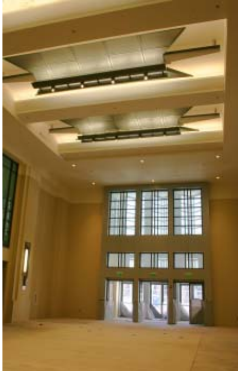
LOBBY ENTRANCE WILL FEATURE SECURITY STATION