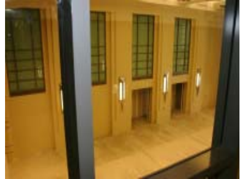
BALCONY VIEW OF MAIN LOBBY