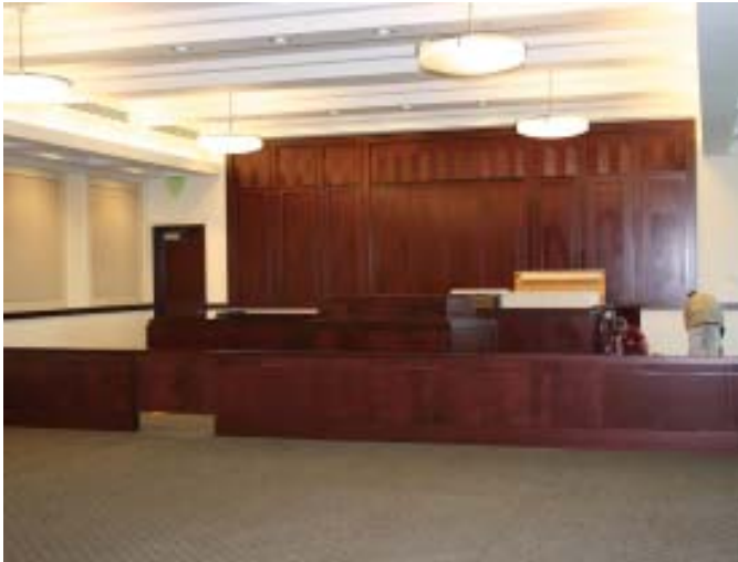
ALL COURTROOMS WILL FEATURE SAME DESIGN AS THIS ONE