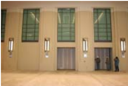
VIEW OF FUTURE BEN WEST CONNECTOR