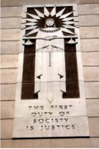
JUDICIAL CREED ON BUILDING