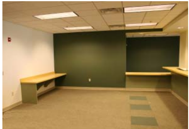
COMPUTER INQUIRY STATION, CASHIER'S COUNTER FOR SESSIONS CUSTOMERS