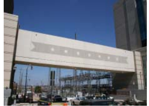
CATWALK FROM CJC WILL ACCOMMODATE INMATES