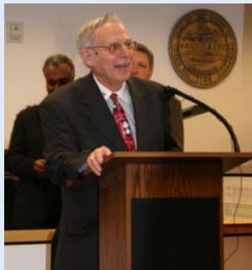
JUDGE LEON RUBEN ADDRESSES GUESTS DURING CEREMONY COMMEMORATING HIS 25TH YEAR AS A GENERAL SESSIONS JUDGE