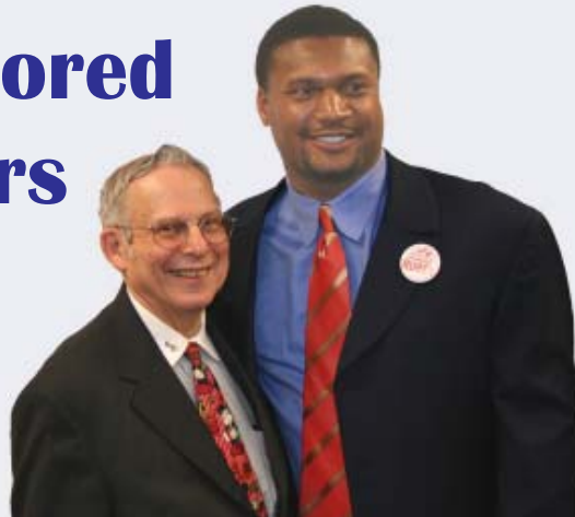
TITANS QUARTERBACK STEVE MCNAIR JOINED CELEBRATION