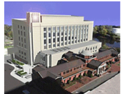
RENDERING OF NEW A.A. BIRCH BUILDING