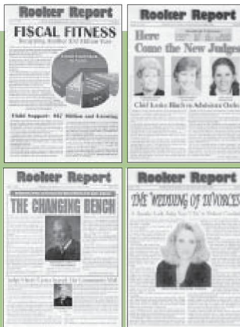
Early issues of report were printed in black/white