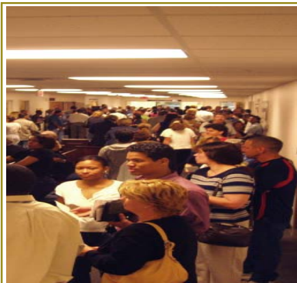
Traffic Court: No Passing Lanes

Meanwhile, trial attorneys were taking advantage of a new state law allowing them to file a broad range of civil pleadings via telephone lines. For the first time, facsimile filings were permitted in certain matters addressing cir-