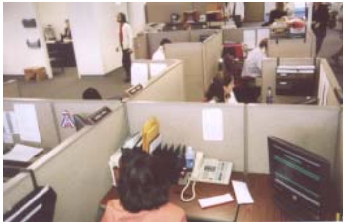
New Circuit Court Clerk's Office