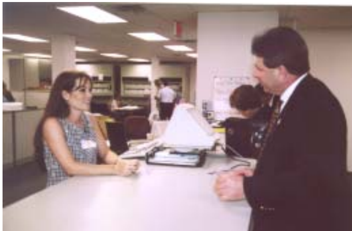
Servicing Customer in General Sessions