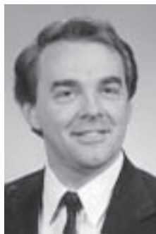
JUDGE AARON HOLT